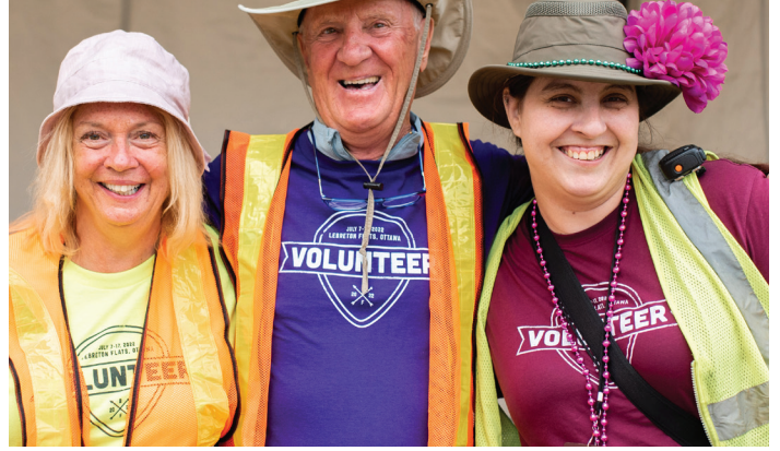
Hari Gopalan Photo Credits © 2022